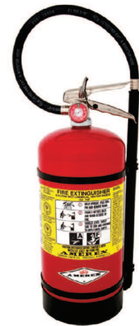
Amerex Model 260

* Appliances must remain under the hood and inside the "zone of protection"